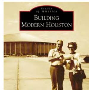
Building Modern Houston by Anna Mod