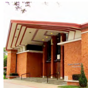
Temple Emanu El, 1500 Sunset Blvd.

Submit form and up to 3 images to: info@houstonmod.org - or - P.O. Box 541353 Houston, TX 77254-1353