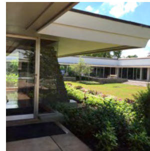
Farnsworth & Chambers (Gragg) Building